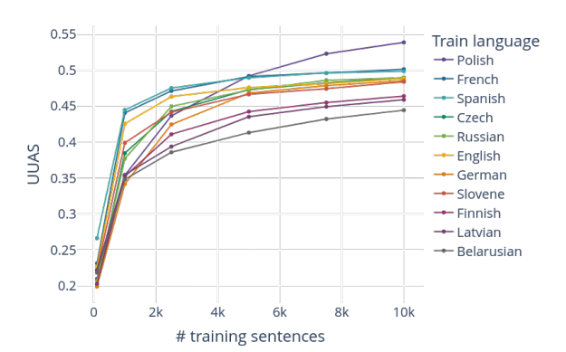
Figure 2: Plot of baseline UUAS scores for probes trained on various languages and dataset sizes, tested on Polish, averaged across 3 independent runs. Word embeddings here are randomly initialised, so the probe cannot access BERT's knowledge. Higher values indicate better syntax recall.